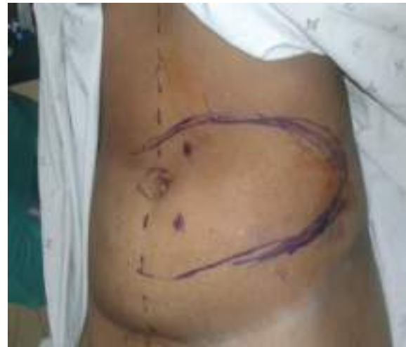
Fig. 1: Two perforators identified about 3 cm from the umbilicus at the base of the flap.

The flap was fashioned around the perforators after determining the length and width based on the size of the defect to be closed (Figure 2). The flap was raised from the distal to the proximal end in the subfascial plane until the perforators were reached (Figure 3). The flap was then