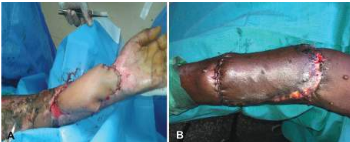
Fig. 5: A. Left volar arm defect fully covered with the two vessel paraumbilical flap immediately after separation. B. Left arm wound fully covered with the paraumbilical flap at 2 months of follow up. Note that the defects had extended between the wrist and the elbow.

advanced into the defect and secured with sutures (Figure 4). After 21 days, the flap was detached and the donor wound closed primarily (Figure 5). The variables measured were the size of the flap, flap-related complications and donor site morbidity.