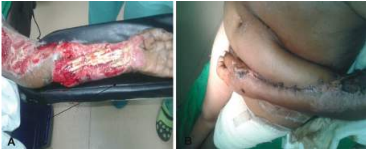
Fig. 4: A. Patients with exposed tendons and neurovascular structures ready to be covered with paraumbilical flap of dimensions 24×10 cm. B. Perforator paraumbilical flap successfully anchored to the recipient site.