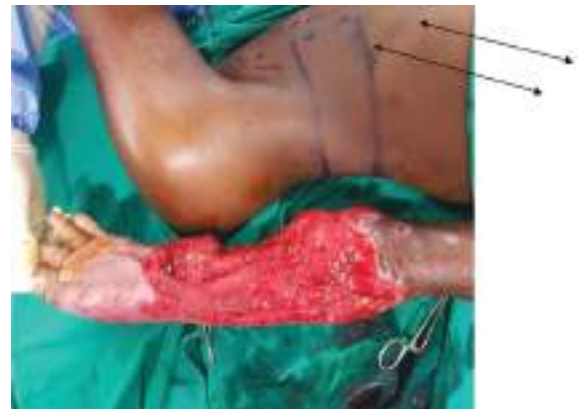
Fig. 2: Patient with extensive arm defect that required free nerve grafts to reconstruct both the median and ulnar nerve with two perforators of paraumbilical flap planned to cover the wounds. The flap dimensions were determined by the size of the wound to be covered. Note the two perforators marked by arrows.